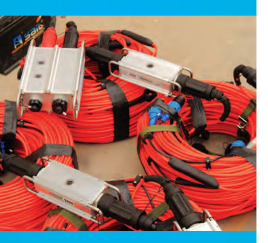
Components are crafted from stainless steel, aircraft grade aluminum & high-strength polycarbonates.