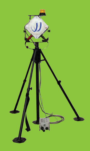
G3i HD NetLink™ offers greater flexibility in designing survey parameters by providing a wireless communication path between two sections of the spread to overcome obstacles in difficult terrains.