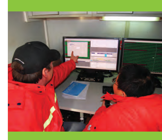
Crew personnel can monitor real-time data during seismic operations using G3i HD's intuitive software.