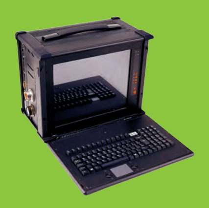
The portable G3i HD SPM Lite is used with the standard G3i HD software and ground electronics for rapidly acquiring 2D seismic data.