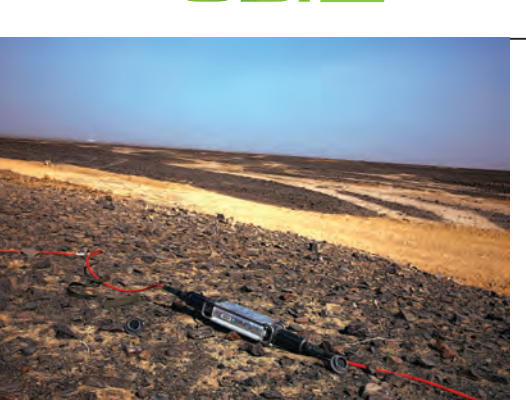
G3i HD's umatched flexibility, unrivaled durablity, and unparalelled high-channel count capabilty places the cabled system in a class by itself.

G3i HD - INOVA's high capacity, cable-based recording system provides geophysical contractors with the best choice for reliable, high quality data acquisition and maximum field operational flexibility.