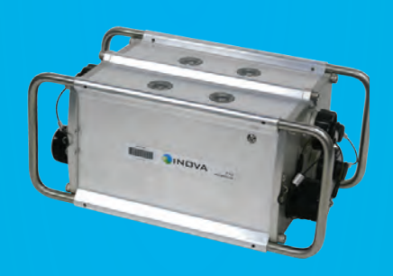
By combing RAM and Tap capabilities, G3i HD Fiber Tap Unit (FTU) offers four channels of digitization capacity along with advanced cross line functions, resulting in less line equipment.