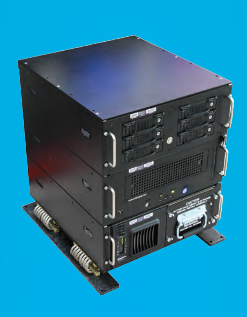
G3i HD's CRS supports high channel count surveys with minimal interconnect and small form factors.