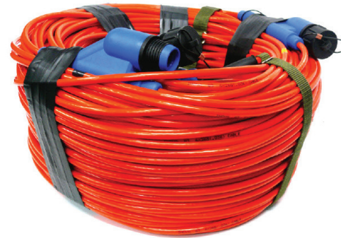
Standard and water blocked cable